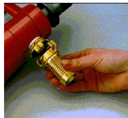
Coupling exhaust adapter for dry drilling