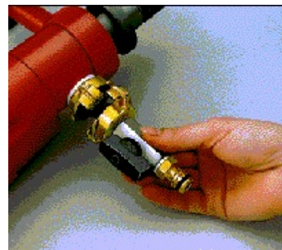
Coupling ball valve for wet drilling