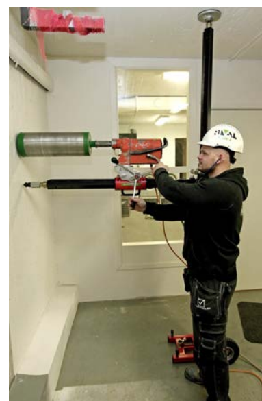
Horizontal drilling using 50 + telescopic drill stand and Weka core drill motor.