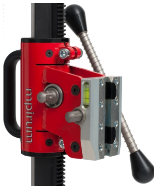
40 + drill carriage with universal motor mounting is both strong and compact.