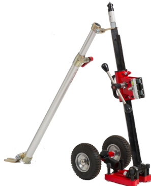
40 + hand held drill stand using FlexSupport + for increased strength.

To the four 40 + och 50 + drill stands with universal motor mounting also have Weka and Ø 60 mm mounting plates as accessories.